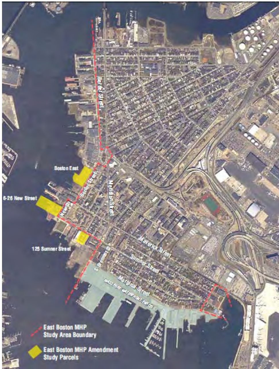
Figure 1. East Boston Planning Area